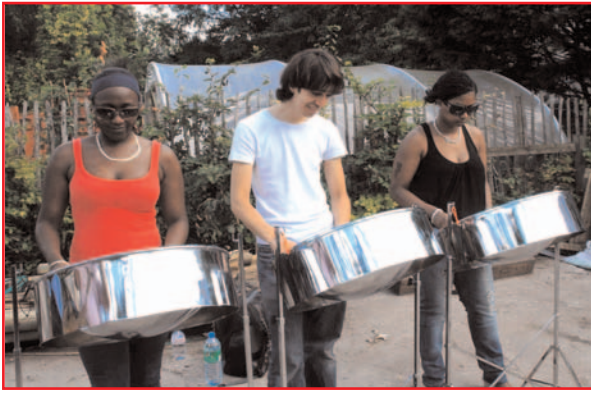
With the Camera Club we get some interesting subjects. Left, getting ready for the competition. Right, an elaborate tomb in Kensal Rise Cemetery.

machines were making the most of the light and the good weather to harvest the corn. We marvelled at the speed and efficiency of modern farming techniques as the sun slowly sank on the horizon. We walked back into Sandridge in the last rays of sunshine ready for a welcome drink in a pub garden bedecked with beautiful tubs and hanging baskets. Pat