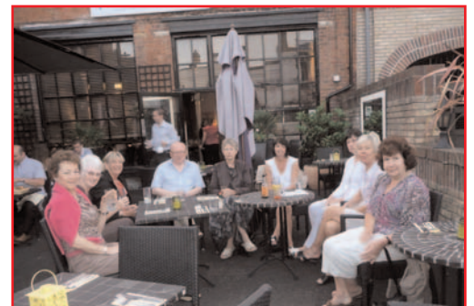
Clockwise from top left. The site of The Hay Wain. Following the yellow corn road. On the bridge over the Stour. Outside The Lemon Tree

largest new woodland planting in the country. We took paths that wandered amongst acres of baby trees that will surely grow into a marvellous forest.