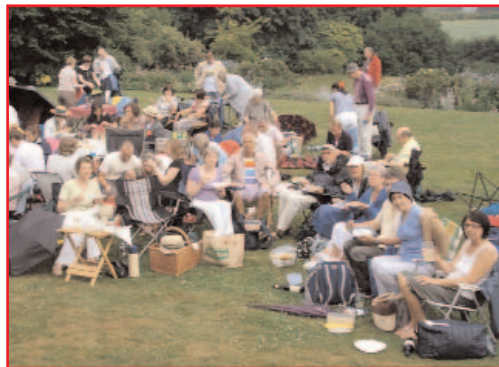
Shaw's Corner: before the rain

woods. The setting sun on the ripe fields of wheat were eye stopping, attractive banks of rosebay willowherb, a couple of buzzards, a field of foals completed the feeling of a relaxing walk. After going through the attractive village of Trowley Bottom we finished back at the Three Blackbirds for a drink. sitting outside until about 9.30. Thank you Dee for a very pleasant evening. Janice