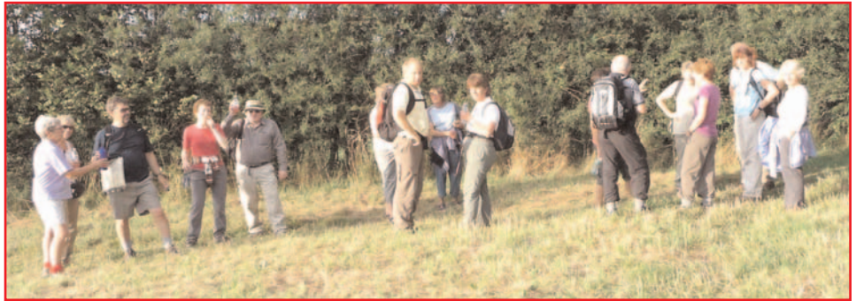
Walking round the new forest

This meant that the audience did not wait to see if the second act would take place as they dashed to the car park for a quick getaway. We assume that the second act was abandoned. In any case it is