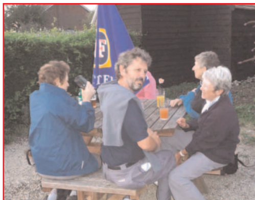
Flamstead. Left, an unusual theme for a weather vane. Above, a refreshing drink as dusk falls

SANDRIDGE. Our party of 17 set off on a balmy summer's evening to walk the boundary of the new Hertswood. We made good time from Sandridge village, walking through the newly opened Langley Wood and up to Pismire Spring, then turning along new footpaths across fields toward Ferrers Lane and Nomansland. Once across the Common we entered a hive of activity on Hammonds Farm where at least three teams of men and