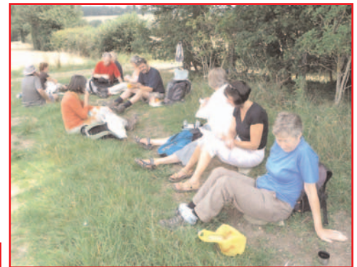
August Day Walk: Above, On Kimpton playing fields. Below, lunch in a shady spot under the hedge