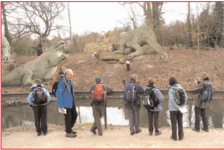
Capital Ring Day 2. Right, signboard at Beckenham Place Park. Above, meeting the dinosaurs.